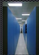
Consumer Database Web Moderate